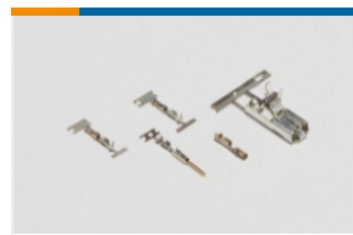
Wire-to-Board Connector Contacts(2)